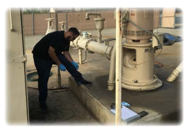
Maintaining Transducer Equipment in One of the Well Sites

All groundwater-level data are checked by Watermaster staff and uploaded to a centralized database management system that can be accessed online through HydroDaVE<sup>SM</sup>. During this reporting period, Watermaster measured 395 manual water levels at 80 wells throughout the Chino Basin, and conducted two quarterly downloads at about 130 wells containing pressure transducers. Additionally, Watermaster compiled all available groundwater-level data from well owners in the basin for the October 2015 to March 2016 period.