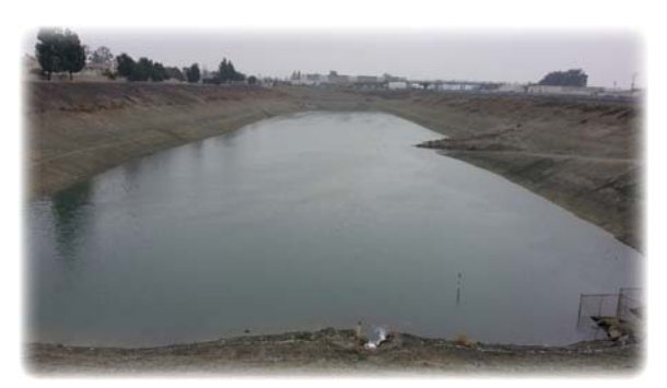
Brooks Basin After a Rain Storm Event

Watermaster and the IEUA measure the quantity of storm and supplemental water that enters into recharge basins using pressure transducers or staff gauges that measure water levels during recharge operations. They also collect weekly water quality samples from recharge basins that are actively recharging recycled water and from lysimeters installed within those recharge