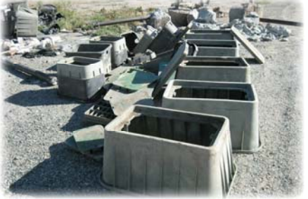
Removal of the Daniels Horizontal Extensometer